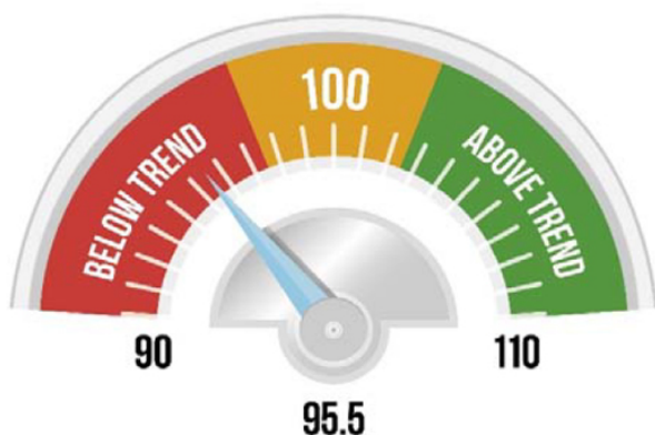
Index history, trend = 100